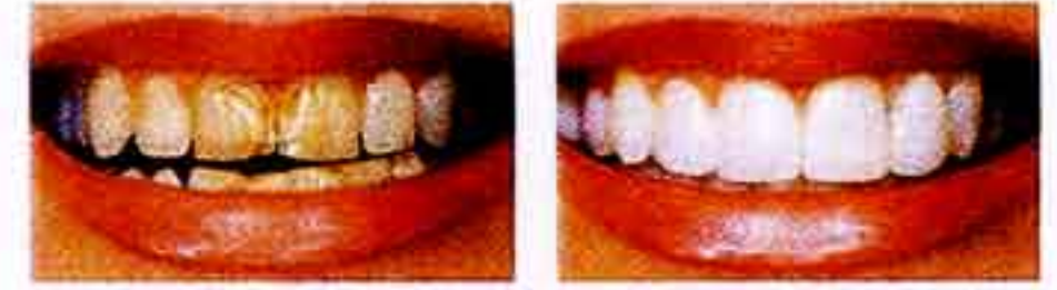
STAINED AND CHIPPED

1 Do you like the appearance of your teeth; your smile? Yes No If not, explain _____